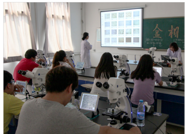
Figure 2 Involving the students supports active learning.

During the education of professions such as medical assistant, dental technician and assistant of veterinary medicine, larger groups of students are required to spend several days per week in a microscopic lab. Learning time is always limited and the course leader often needs to set-up and dismantle the systems in shortest time. The microscopes must be robust and easy-to-use. A digital classroom is a major benefit to course leaders – it allows them to use microscopes that are connected to each other, and digital