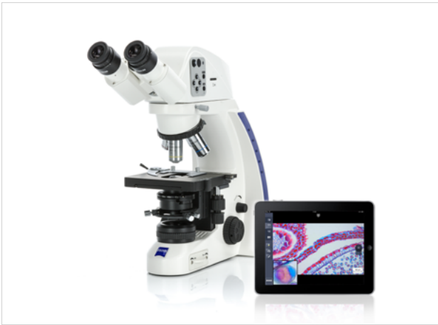
Figure 5 ZEISS Primo Star HDcam with integrated camera: the right microscope for educators and students alike.