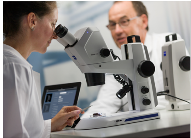
Figure 6 ZEISS Stemi 305 cam: the router is integrated in the microscope.

Stemi 305 cam is your compact and easy-to-use stereo microscope with a 5:1 zoom for educational tasks. The fast, color Wi-Fi camera and WLAN router are already integrated into the microscope body. In "Access point" mode each Stemi 305 cam creates its own WLAN: up to six iPads can connect directly to the integrated camera and display its live image using the iPad imaging app Labscope. To create a high quality digital classroom, enable "Add to existing WLAN" mode and connect several Stemi 305 cams to the same digital network. Create your own virtual classroom by using Labscope, the iPad imaging app, to stream live images