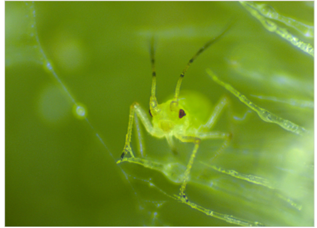
Figure 8 Aphid, acquired with ZEISS Stemi 305, reflected light, brightfield