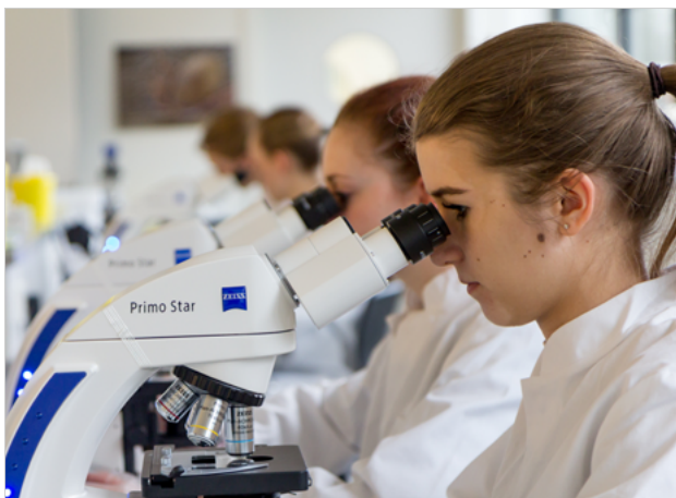
Figure 1 The classical way of teaching: students as passive observers.

Teaching is the art of passing knowledge of the few on to the many. For this you need a good overview of all the learners, a deep insight into the individuals, and the option of networking them all together. A digital classroom with connected microscopes is a valuable tool in teaching today. It enables endless opportunities to create hands-on, customizable learning experiences and build deep understanding in the classroom. Students learn easily from each other and experience learning successes in a playful way. Connected microscopes offer an interactive, digital platform which increases attention and motivation, and also gives freedom to the teacher.